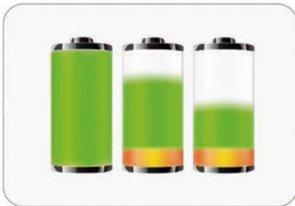
Independent battery compartment