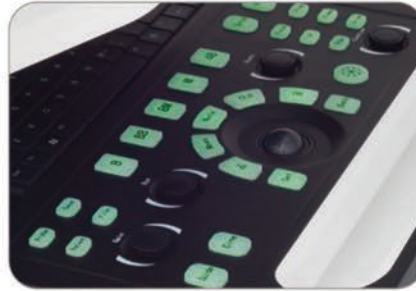
Backlight button, convenient to operate in darkroom