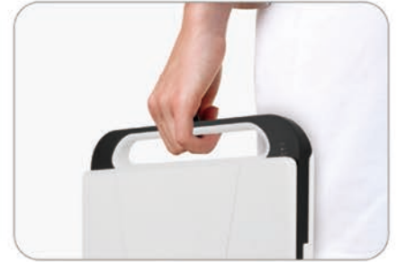
convenient to carry