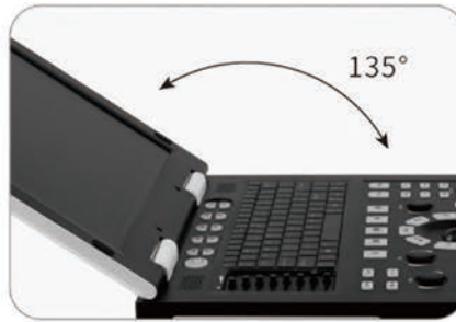
Extends to 135 degrees